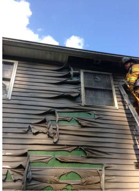
Firefighters check for extension

On June 9, 2013 the fire department was dispatched to 34 Sheffield Way for grill fire with extension to a structure. C2 arrived on scene finding homeowner attempting extinguishment with garden hose. Fire crews checked for extension into attic.