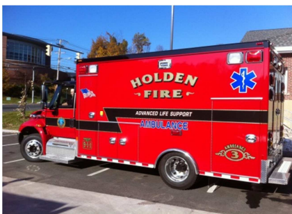
NEW Ambulance 3

EMS Training will be held on Tuesday, November 22 nd at Fire Headquarters at 19:00.